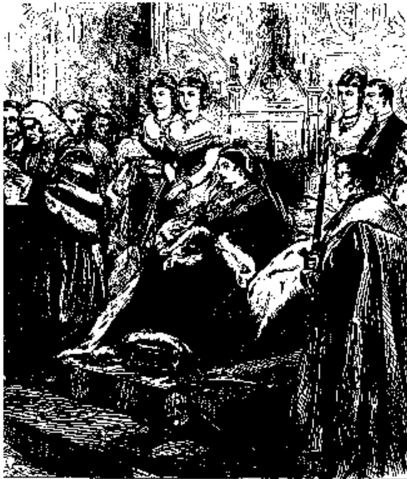
Queen Victoria opens Parliament, 1837