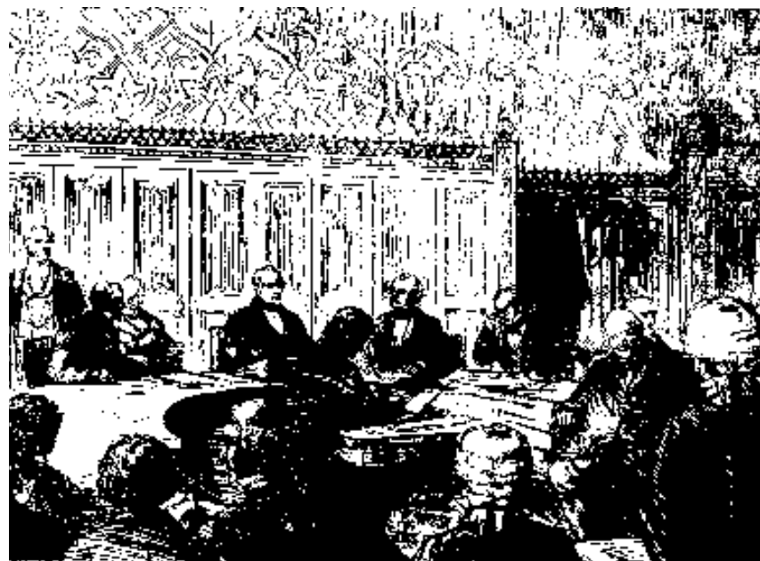
A Select Committee of the House of Commons in Session, 1833