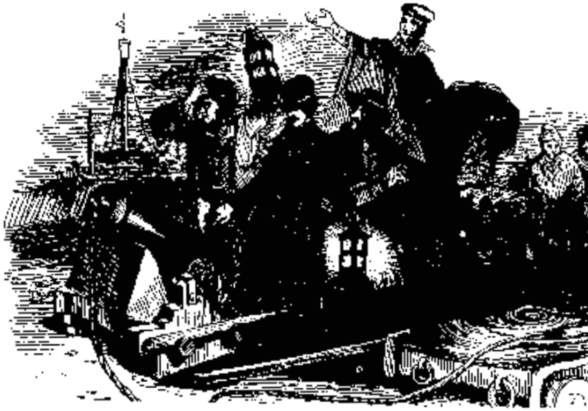
Captain Manby's Mortar Life-Line, Subject of three Reports from Select Committees, 1810, 1813-14 and 1823