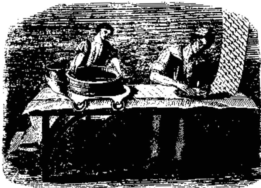
Block printer and Teeter from Report on Children's Employment, 1842