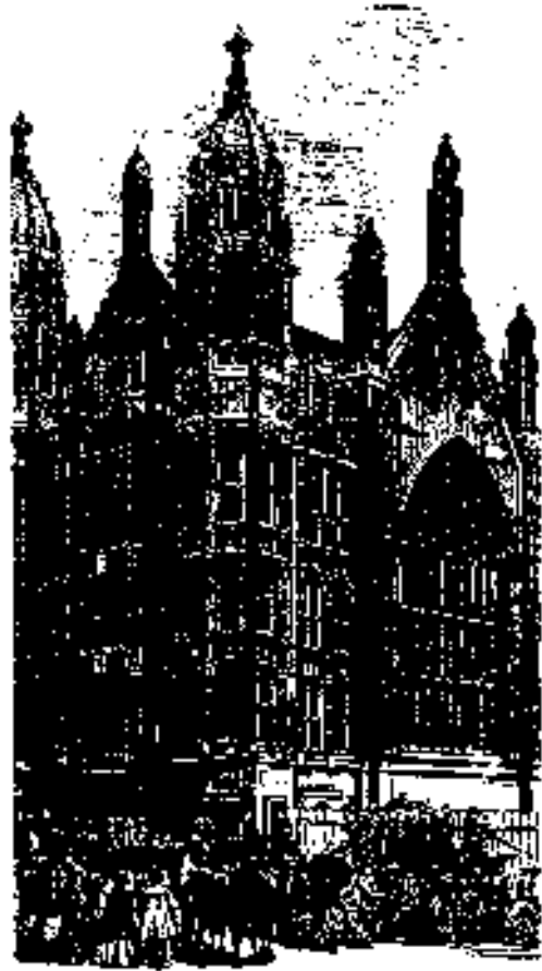
The newly built Houses of Parliament St Stephen's Park, 1854